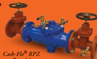
Cash-Flo® RPZ Page 14

Just a few examples of how we apply deeper thinking to water control technology.