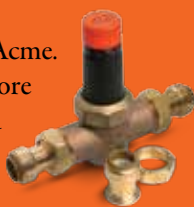
SoloSet® EB-25 Pages 9-10

stored at germ-killing temperatures, while delivering it at a safe 120°F or less. SoloSet®, our pressure reducing valve that reduces labor from a two-man job to a two-finger twist of its cap. Cash-Flo®, the industry’s most maintenance-free backflow preventers. And the SharkBite® push-fit fitting connection system with valves and PEX tubing – the fastest, easiest way from meter to fixtures and the industry’s only Total Rough-In Solution.™