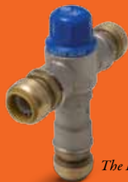
The Heatguard® Series, Pages 5-7

In short, we don’t just build it, we overbuild it. The result is industry-leading products like Heatguard®, our thermostatic mixing valve that allows water to be